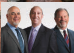
Janet, Jenner & Suggs, LLC Powerful Allies for Whistleblowers See page 11