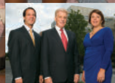
Regan Zambri & Long Advocates for Consumer Safety See page 23