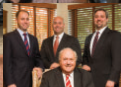
Paulson & Nace's Enduring Commitment to Injured Victims See page 17